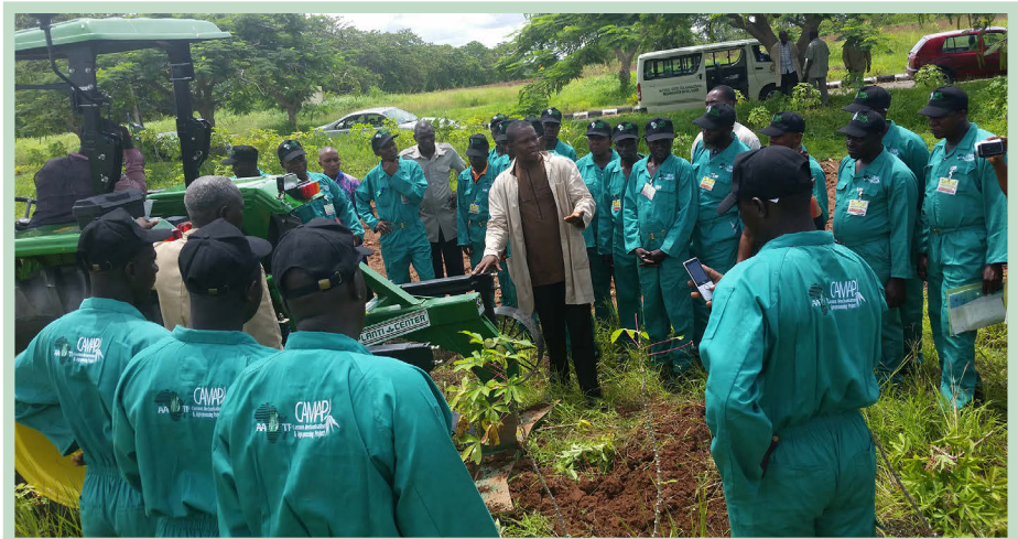
An instructor takes the trainees through procedures for good tractor operations and maintenance.

CAMAP, funded by UKAid, seeks to transform the cassava sector in Sub-Saharan Africa (SSA) by enhancing commercial production, processing and market linkages based on business models that engender sustainability. It also aims to address key constraints to cassava