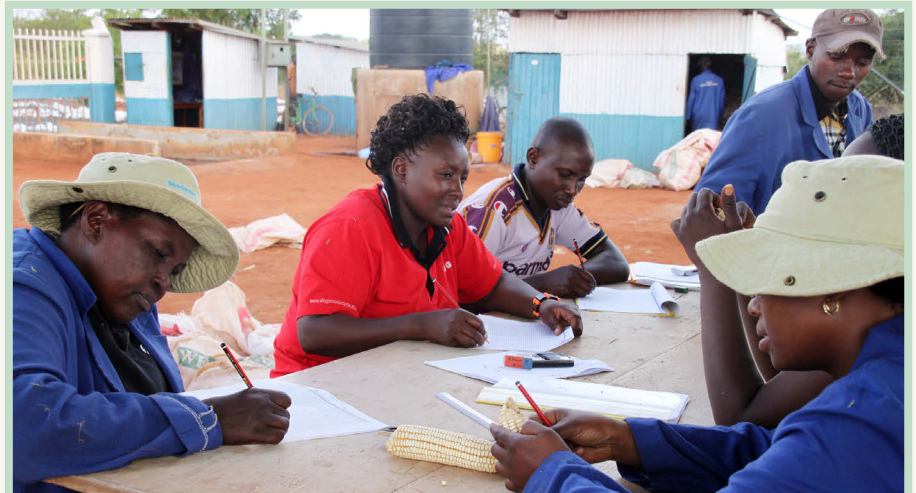
KALRO staff entering data after harvesting one of the CFTs at KALRO-Kiboko Research Station.

the wheel, which is often costly and time consuming with results only confirming what was initially concluded.