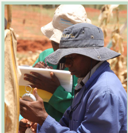
KALRO staff collecting data on performance of the Bt maize of one of the CFTs at KALRO-Kiboko Research Station

Data sharing is central to all scientific communities. Nobody needs to re-invent