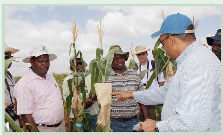
The WEMA team members visit a maize trial in Kiboko, Kenya during the 2013 review and planning meeting in February 2013.

During the meeting, participants also laid out plans for the deployment of the first WEMA conventional drought-