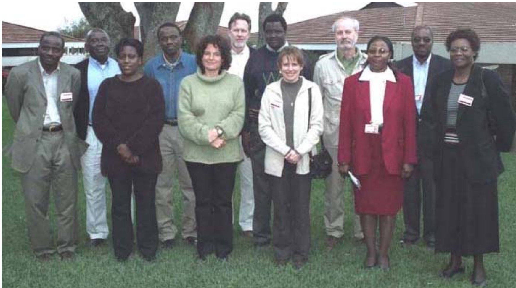
Participants in the Constraints to Cowpea Production and Utilization in Sub-Saharan Africa Small Group Meeting, Held 1—11 July 2003 at AATF Headquarters, ILRI, Nairobi Kenya